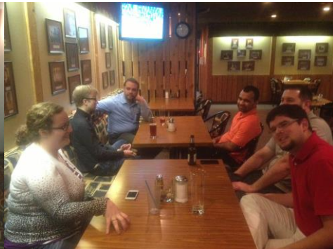
YEA Bowling (2014-10-01)