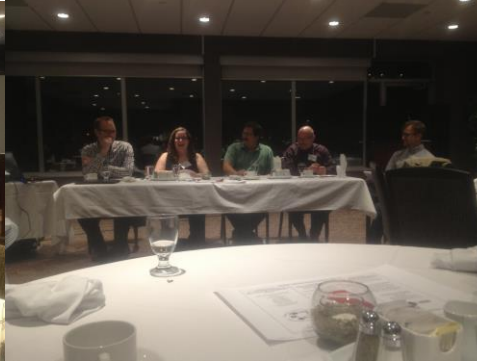
Discussion Panel (2014-10-14)