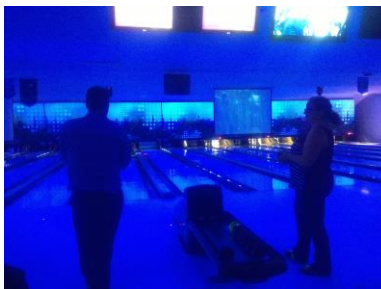
YEA Bowling (2014-10-01)