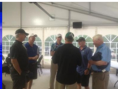
Golf Supper (2015-06-12)